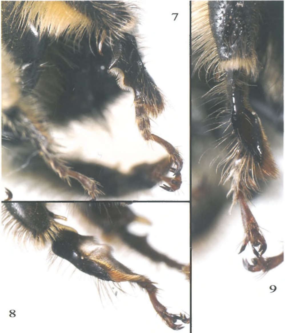
Figs 7-9: Cubitalia (Cubitalia) baal sp. n., male hind leg. – 7 anterior surface of metabasitarsus. – 8 oblique, inner-posterior surface of metabasitarsus. – 9 outer dorsal surface of metabasitarsus.

scattered, shallow, faint punctures; pleura with faint punctures separated by 1–3 times a puncture width. Metasomal terga imbricate and punctate, punctures shallow, small, and separated by 1–2 times a puncture width; metasomal sterna imbricate except smooth between lateral tufts on fifth metasomal sternum.