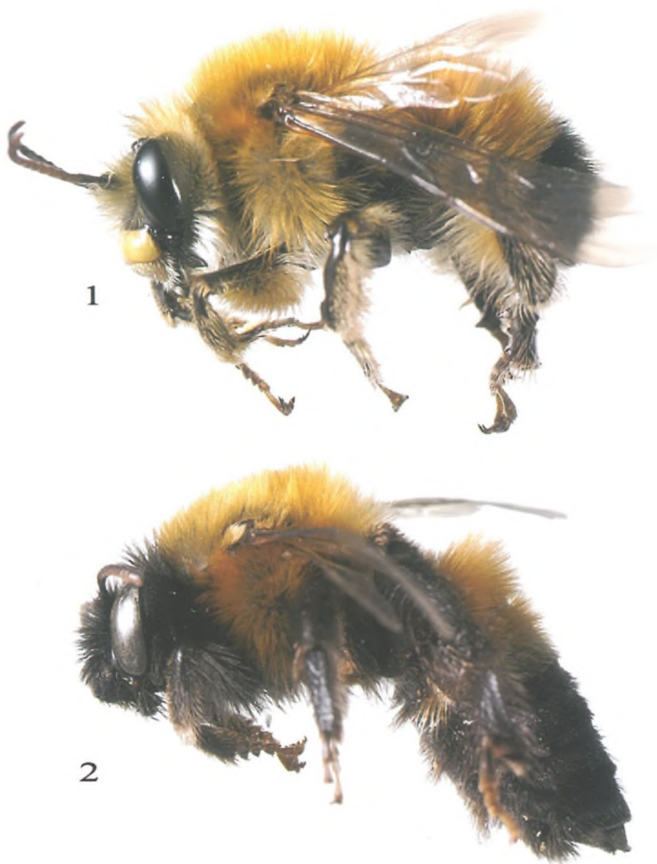
Figs 1-2: Cubitalia (Cubitalia) baal sp. n. – 1 lateral habitus of male holotype. – 2 lateral habitus of female paratype.

Integument of clypeus and labrum smooth; labrum with coarse punctures separated by a puncture width or less; clypeus with sparsely scattered, shallow, coarse punctures. Mandibular surfaces smooth. Integument of remainder of head strongly tessellate except faintly imbricate (nearly smooth) in small patches immediately anterior to and bordering median ocellus and along outer margins of lateral ocelli. Face with faint punctures