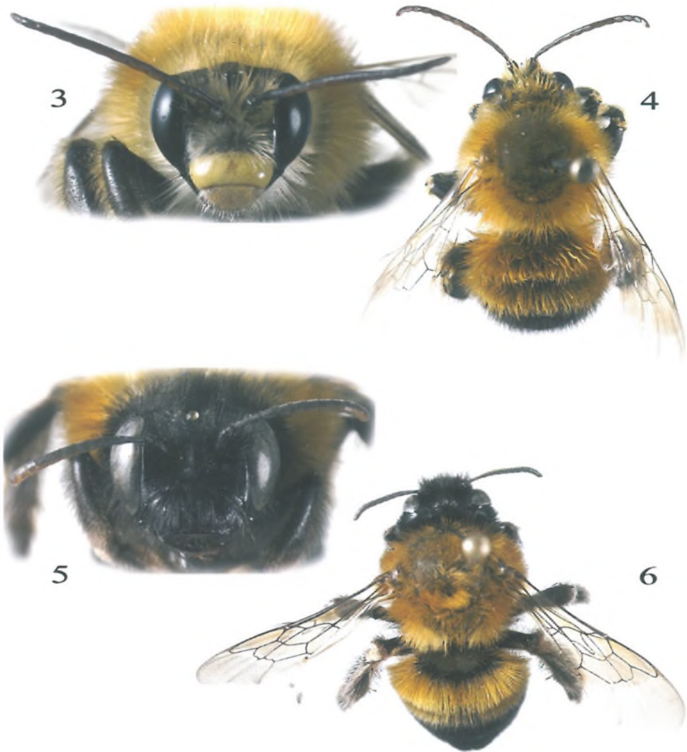
Figs 3-6: Cubitalia (Cubitalia) baal sp. n. – 3 facial aspect of male holotype. – 4 dorsal habitus of male holotype. – 5 facial aspect of female paratype. – 6 dorsal habitus of female paratype.

separated by 1–3 times a puncture width except on lower paraocular area punctures separated by a puncture width or less; punctures of vertex more distinct and contiguous; punctures on gena distinct and separated by a puncture width or less. Mesosoma strongly tessellate throughout except tegula faintly imbricate and impunctate; mesoscutum with distinct punctures separated by 2–3 times a puncture width centrally, along borders such punctures separated by 1–2 times a puncture width; mesoscutellum sculptured as on mesoscutum; metanotum strongly tessellate and impunctate (apparently slightly nodulate); propodeum strongly tessellate and impunctate on basal area, laterally with a few sparsely