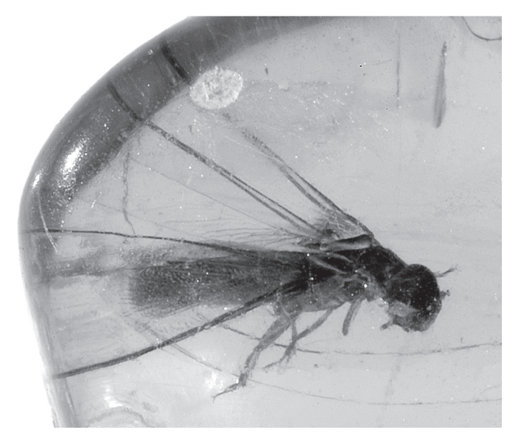
Fig. 8: Photomicrograph of new specimen of Cryptotermes yamini Krishnal & Bacchus (DR-8-339).

The specific epithet is the Latin term glaesarius, meaning "of amber."