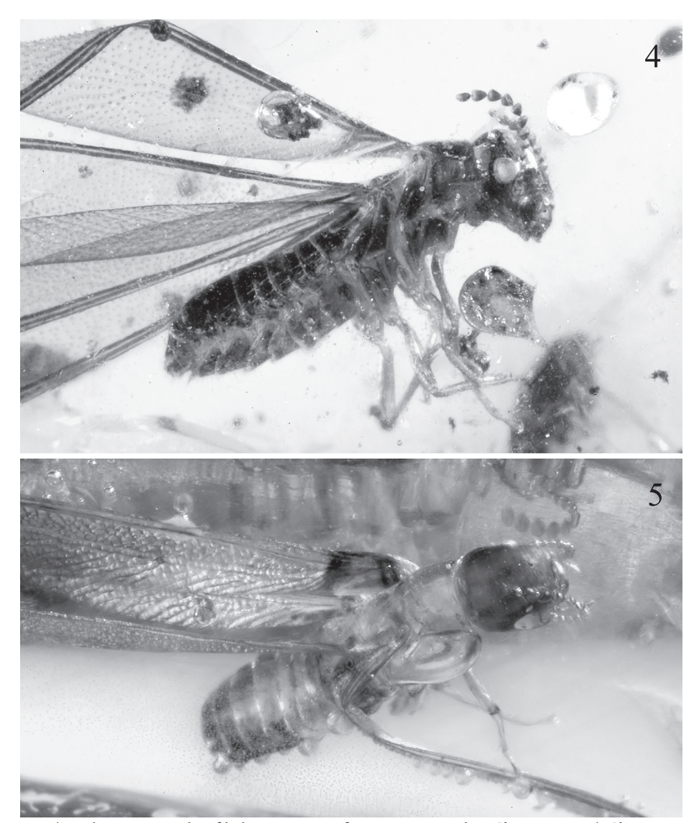
Figs 4-5: Photomicrographs of holotype imagoes for Dominican amber Glyptotermes . – 4 Glyptotermes paleoliberatus sp. n. (DR-14-647). – 5 Glyptotermes grimaldis sp. n. (DR-10-1505).

and completely hyaline nodule apices. In most of these features the fossil resembles modern G. pubescens but that species has a distinctly glabrous integument and the typical proportions of the basal antennal articles.