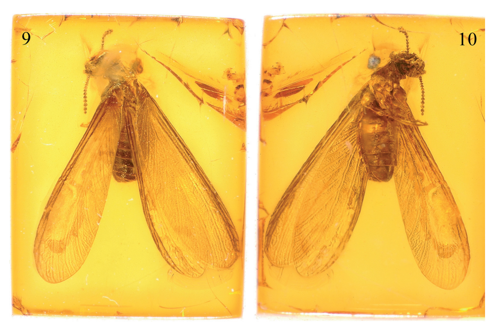
Figs 9-10: Photomicrographs of holotype imago of Incisitermes krishnai Emerson (UCMP 12613). – 9 Dorsal aspect. – 10 Ventral aspect.