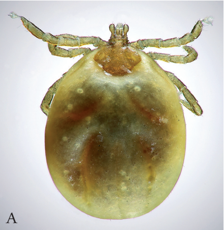
Fig. 3: Photographs of the seabird tick Ixodes (Multidentatus) percavatus. (A) Larva, dorsal view. (B) Detail of mouthparts.