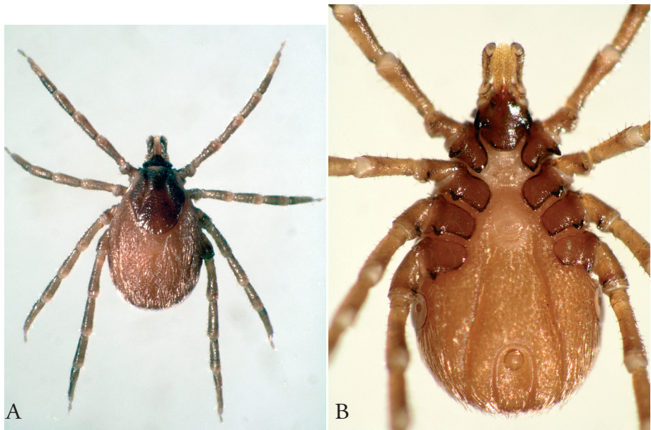
Fig. 2: Photographs of the seabird tick Ixodes (Multidentatus) zumpti female. (A) Dorsal view. (B) Ventral view.

Together, the 64 birds and 13 mammals of the Tristan archipelago represent some 77 potential hosts for ticks (Order Acarina). Despite this relatively large number and the fact that livestock and domestic animals were introduced to the islands as early as 1790 (including Gough until the