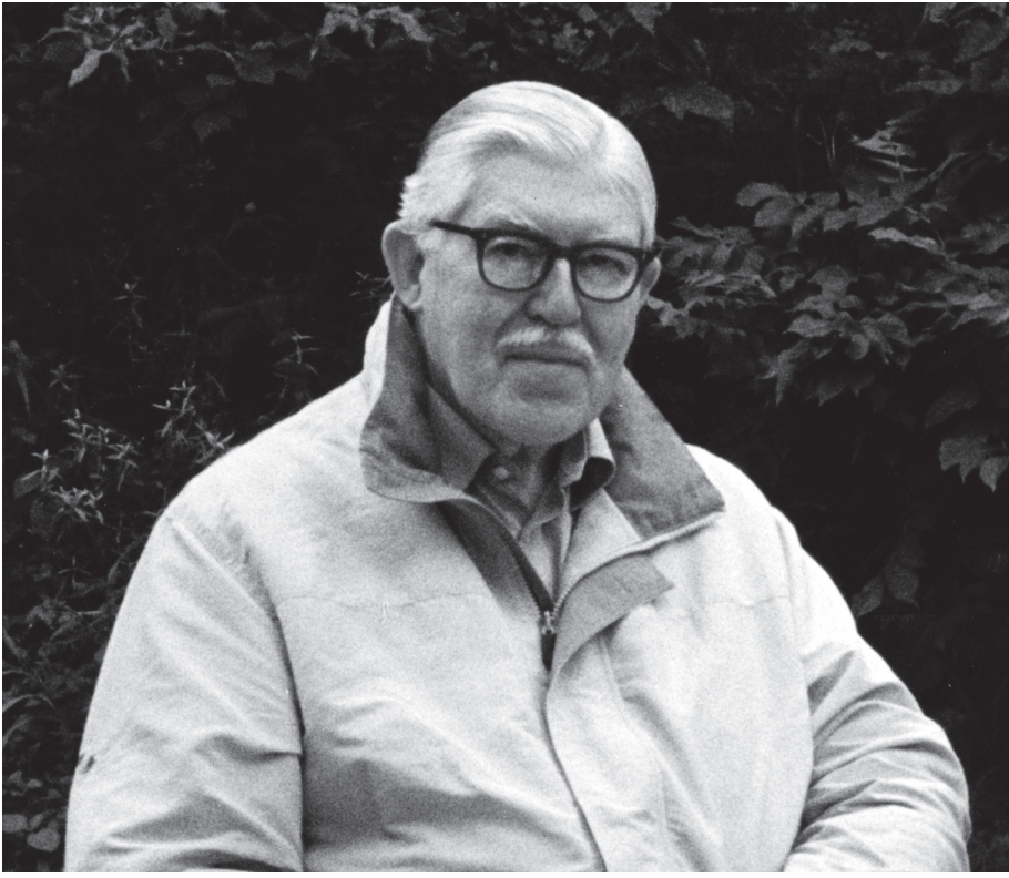
Fig. 5: Baker in Vienna (2002).