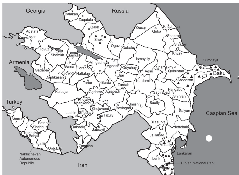
Fig. 1: Map of Azerbaijan: o designations; ▲ - material collected area.

Field work was conducted from 1994 to 2004 from April to September in the North (Sheki-Zagatala - 1995), East (Baku-Absheron - 1995-1997, 1999-2000, 2004) and South (Lenkoran - 1994-1997, 2001, 2003-2004; Astara - 1994-1998; Masalli - 1995-1996, 1998) regions of Azerbaijan. Forests, orchards, gardens, and roadsides were investigated within the research areas; Hirkan National Park also was sampled. The paper includes the leaf-rollers found on the host plants (trees and bushes only) in larval or pupal stage. Collected larvae and pupae were kept in the laboratory until imagines hatched. Species determination was done according to these imagines. Species were collected in nature in the larval and pupal stage.