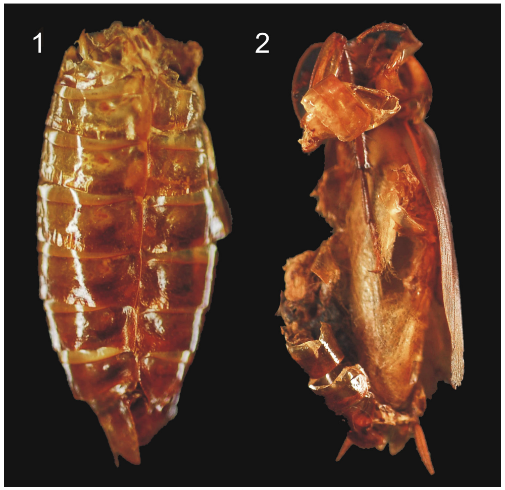
Figs 1–2: Abdomen and thorax of the host Periplaneta americana with cocoons of Ampulex compressa inside: 1 not dissected: 2 dissected.