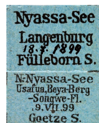
Fig. 1-3: Prolytta nyassica spec. nov.: 1 (left): dorsal view of the holotype; 2 (center): lateral view of the aedeagus; 3 (right): labels of different types.