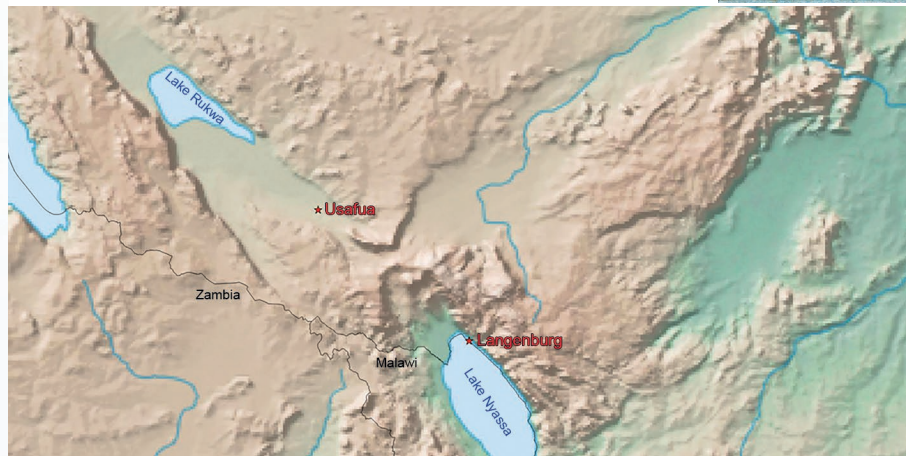
Map 1: Distribution area of Prolytta nyassica spec. nov. in southern Tanzania.