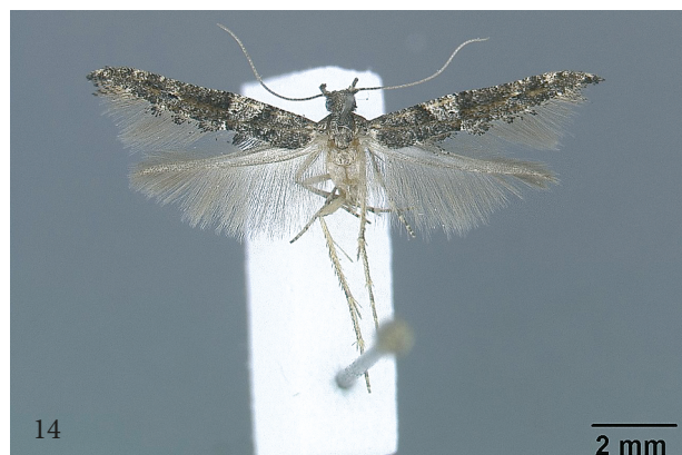
Figs 7-14: 7 - Epermenia (Calotropis) dallastai ; 8 - Epermenia (Calotropis) costomaculata ; 9, 10 - Epermenia (Calotropis) turicola ; 11 - Epermenia (Calotropis) hamata ; 12 - Epermenia (Calotropis) aarviki ; 13 - Epermenia (Calotropis) ruwenzorica ; 14 - Epermenia (Calotropis) tenuipennella .