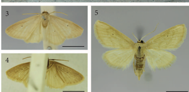
Fig. 1: View from the lava covered Wideawake Fairs to the Green Mountains. The Green Mountains have a dense vegetation of introduced vascular plants, whereas lichens form the dominant vegetation of the lava field. – Fig. 2: At Devil's Ashpit near the former NASA building. The shrubs are mainly Juniperus bermudianus , Psidium guayava , Vitex trifolia , Lantana camara , Cyperus owanii and Casuarina equisetifolia (SIM, in litt. 2018). – Figs 3–5: 4. \sigma Holotype of Scopula ascensionis spec. nov., dorsal view; \sigma paratype of Scopula ascensionis spec. nov., ventral view; \sigma paratype of Scopula ascensionis spec. nov., dorsal view. Scale bar 5 mm.

S. ascensionis spec. nov. differs from S. lactaria (WALKER, 1861) in the absence of transverse lines and black terminal dots. The aedaeagus of S. lactaria is smaller, the basal part of the fibula elongated and the ceras shorter. S. separata (WALKER, 1875) an endemic Scopula from