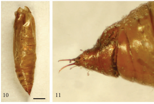
Fig. 8: Larva of Scopula ascensionis spec. nov., lateral view. – Fig. 9: Larva of Scopula ascensionis spec. nov., dorsal view. – Fig. 10: Exuviae of Scopula ascensionis spec. nov. – Fig. 11: Cremaster of pupa of Scopula ascensionis spec. nov.